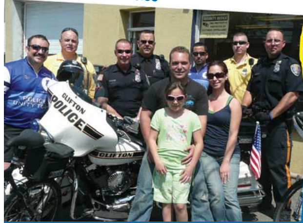
NOC Automotive / Telep Motors