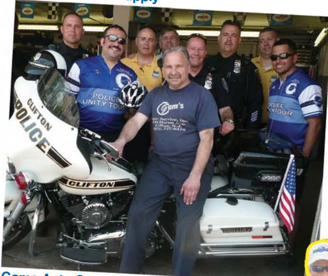
Gams Auto Service