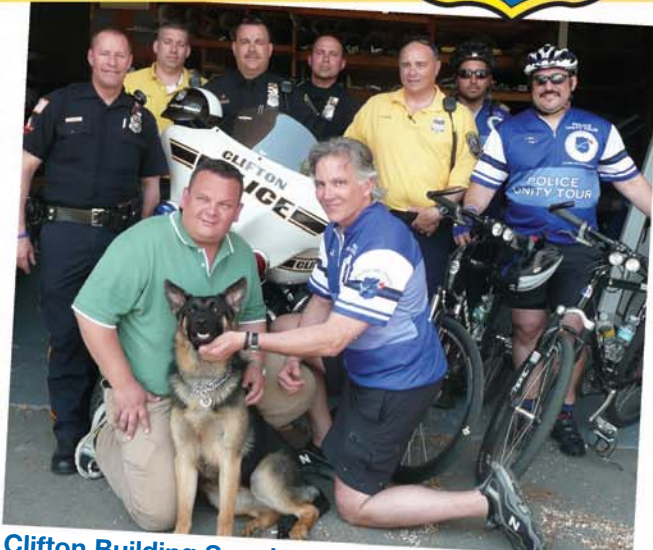
Clifton Building Supply