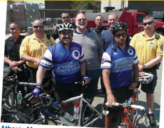
Athenia Mason Supply